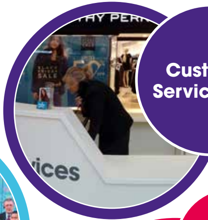
Customer Service Staff