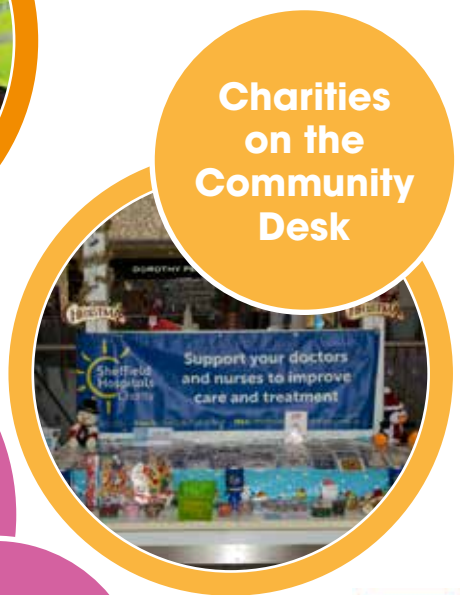
Charities on the Community Desk