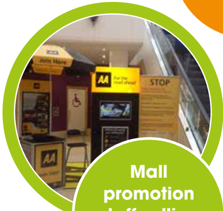
Mall promotion staff selling products and services